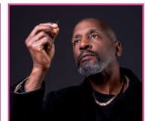
Willard Wigan MBE Internationally renowned micro artist

Book tickets today at www.autismshow.co.uk